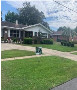
34 Poplar Ave

34 Poplar Ave the Dickey Family & 2 Poplar Ave the Higginbotham Family & 5 Walnut Ave the Erven Family