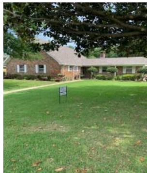
2 Poplar Ave

This year we will have two Yards of the Month, one for each street being judged. If there is no winner on a street, then there will only be one winner.